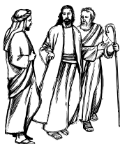
On the Road to Emmaus